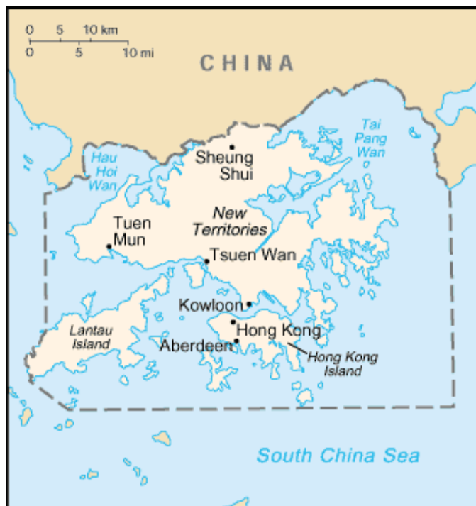
A map of colonial Hong Kong. Photo courtesy of Wikimedia Commons. Public domain.

particularly Hong Kong Island with its highest point being Victoria's Peak at 1,800 feet. Also named after the former British Queen was the colony's major city and de facto capital of Victoria, located in the northwest corner of Hong Kong Island. As Hong Kong's climate is sub-tropical, it receives heavy and often unpredictable rainfall to complement its winter and summer monsoons. The hottest temperatures are between the spring and