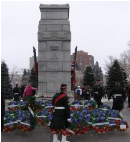
Remembrance Day November 11, 2006 Calgary, Alberta