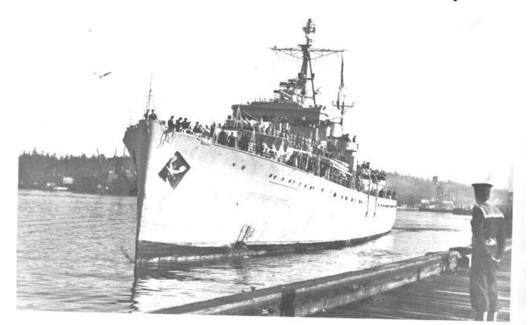
HMCS Prince Robert, here shown arriving at Esquimault in 1945 with prisoners of war, carried C Force men both to and from Hong Kong.

After a brief hospital stay in friendly Guam, some Canadian soldiers like my father were asked if they wanted to fly back to North America. Arriving in San Francisco, they boarded a train northward to Seattle and a three-hour ferry ride to Victoria B.C.