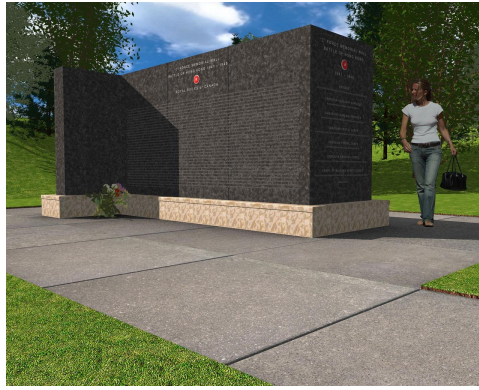
Artist rendering of the Wall

WOW!!! Is an understatement of the presentation result of the Memorial Wall project at the 2007 National Convention in Calgary.