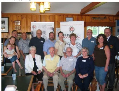
2011-06-18 Veteran Luncheon Crystal Beach 1.JPG