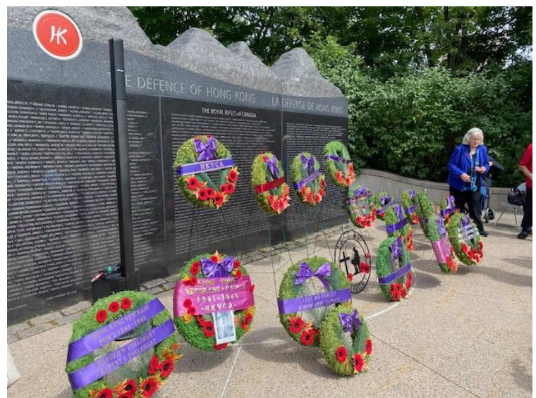
All of the 20 wreaths that were laid.