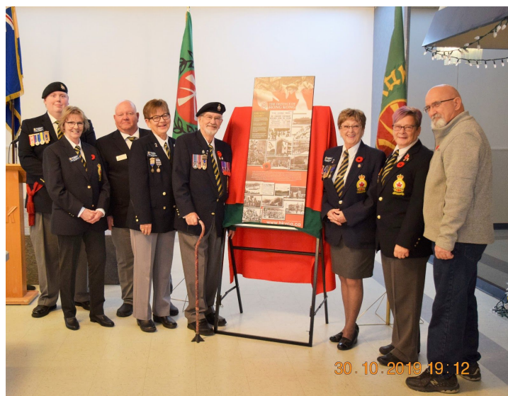
Medicine Hat Royal Canadian Legion #17 Executive with HKVCA Commemorative Plaque