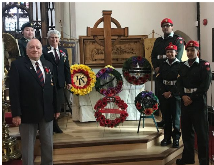
St. Luke's church for Remembrance Sunday with Winnipeg Grenadier cadets

We were able to arrange to have the HK Vet flag flying at the Cenotaph on Memorial Boulevard near our Legislative Building for the month of August and December to honour 'C' Force.