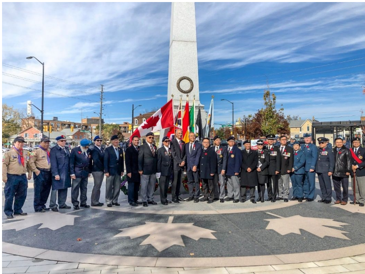
Participants in Commemoration Ceremony at Markham Cenotaph

On Saturday, October 26 the Royal Hong Kong Regiment (The Volunteers) Association of Ontario held a ceremony in Markham to commemorate the Battle of Hong Kong. It was a nippy, but sunny day at the cenotaph and the ceremony was well-attended. Local, provincial and federal politicians participated, and I was asked to give a short recounting of the Battle story. Many of the attendees were of Chinese heritage, and the event was well covered by local Chinese broadcast and print media. Several wreaths were laid, including by the St John's Ambulance organization. Members of The Volunteers fought alongside the Canadians in 'C' Force, and St John's Ambulance Corps members were also involved in the Battle of Hong Kong.