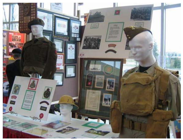
Part of the display at First Markham Place Mall

Ken was unable to be at our May 1<sup>st</sup> meeting in Toronto, because at that very same time he was showing the Governor General our exhibit at First Markham Place Mall. Mme. Clarkson was present at the initial ceremony held that day, inaugurating the celebration of Asian Heritage Month in Canada. Several displays for the public to view provided the backdrop for the Governor General's