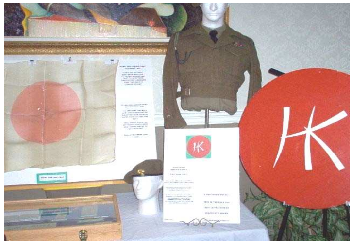
Sample of memorabilia on display

The festivities started on Friday evening as the Aurora Branch of the Royal Canadian Legion hosted a pub night at their beautiful facilities just 5 minutes away from the reunion hotel. With fish & chips for dinner, some excellent (and very funny) musical entertainment, a parade of Veterans and lots of conversation, all of us enjoyed the evening immensely. Many Legion members were there to share the evening with us, and their hospitality was just wonderful.