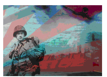
RING OF FIRE DECEMBER 7TH 2011 TO JUNE 3RD 2012