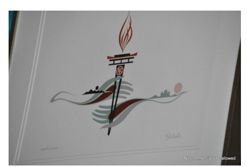
Beautiful artwork gifted to the attending veterans.

There are more photos on facebook too – Enjoy!!