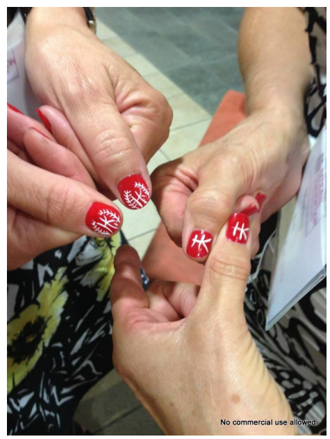
Some ladies getting into the theme