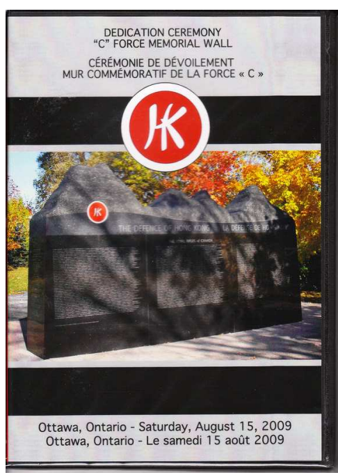
Memorial Wall Dedication Video

We are fortunate to have some copies available for our members on the Memorial Wall Dedication that occurred in Ottawa in August 2009. The cost is $25.00 including postage.