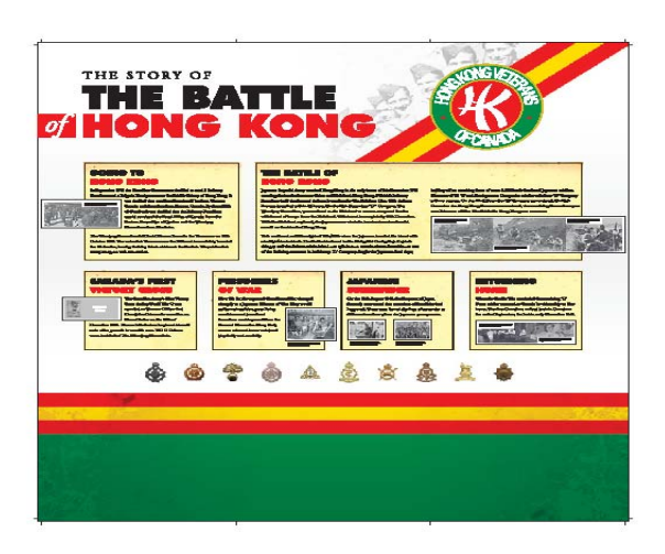
Figure 2 HKVA display

Vince Lopata, arranged to have the HKVA display set up at the Manitoba Aviation Museum on Ferry Rd for the month of December.