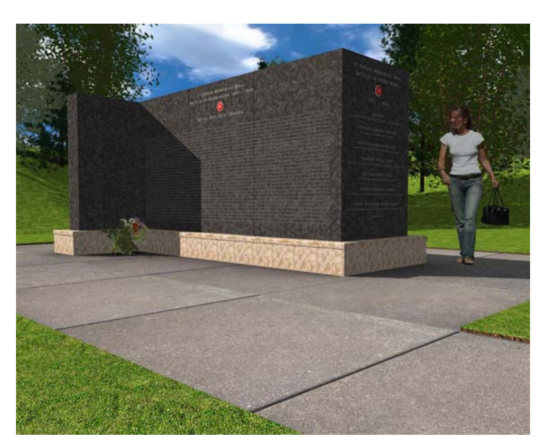
This is an artist rendering of the Project.

posted on our website, www.hkvca.ca. For those who do not have computers I will mention them in this article.