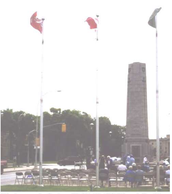
Winnipeg cenataph, August 2002. The HK Veteran's flag flies here in August and December. We will remember them.